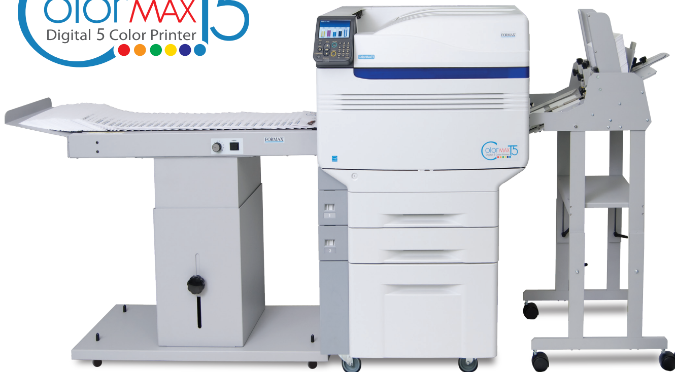
ColorMaxT5 System: Digital 5-Color Printer, Output Conveyor and Envelope Feeder