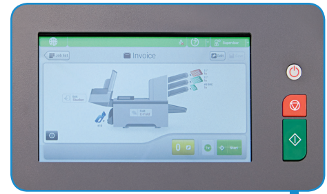
Full-color 7" touchscreen control panel with graphical interface and paper /envelope presence sensors

* Paper & envelope specifications may vary. All media must be tested.