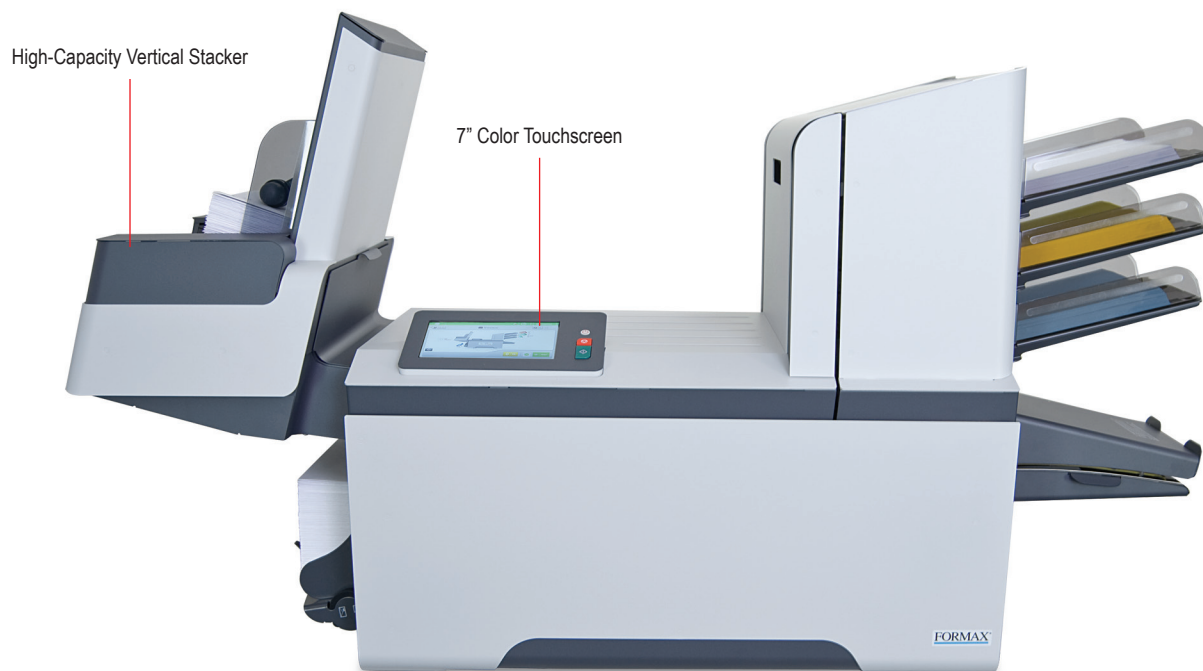
FD 6306-Standard 3 with High-Capacity Vertical Output Stacker