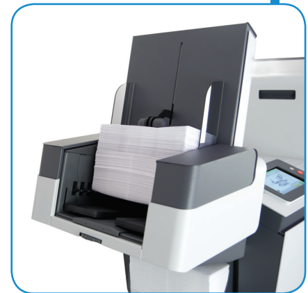
High-Capacity Vertical Stacker holds up to 500 filled envelopes